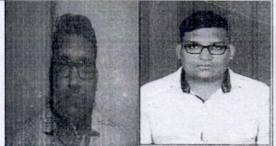
Test Day Photo